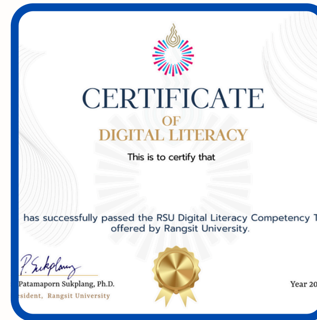
Certificate of Digital Literacy