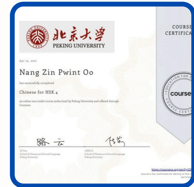
Certificate of Completion Chinese for HSK 4