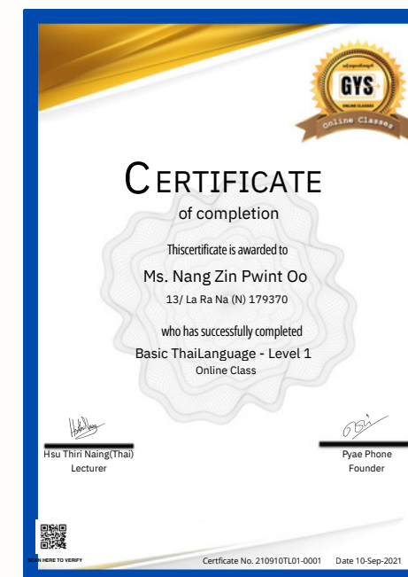
Thai language (Basic & Intermediate)