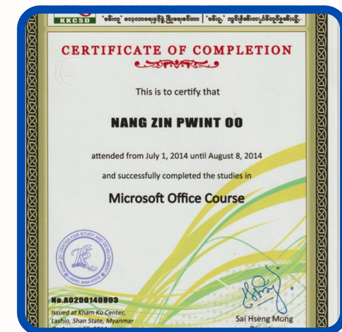
Microsoft Excel (Intermediate–Advanced)